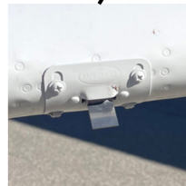
Stall Warning Tab