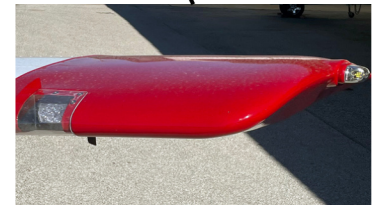
NAV and Strobe