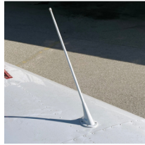
Communication 1 Antenna