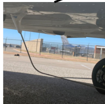
Communication 2 Antenna