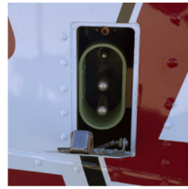
External Power Receptacle