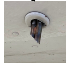
Heater Fuel Drains